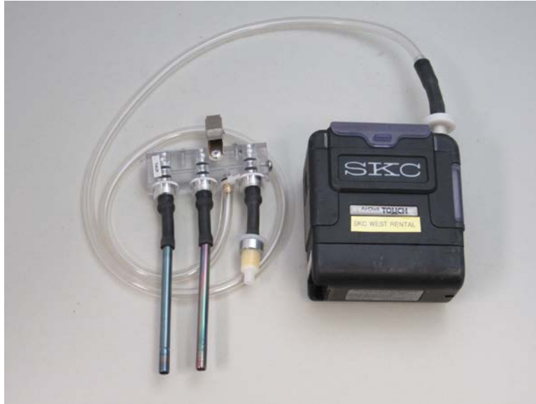
Figure 2. Air Sampling Assembly of SKC AirChek Touch Pump, CPC, and Single Tube Holder