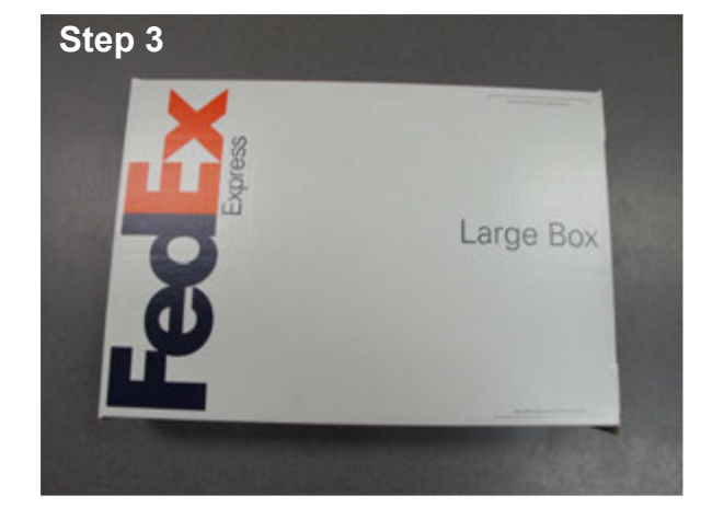
Place sample package in large FedEx box 18-in x12-in x3-in (45-cm x 30-cm x 7.5-cm) or your own box

custody form, 2 copies of shipping label, and 4 copies of commercial invoice for international shipping.