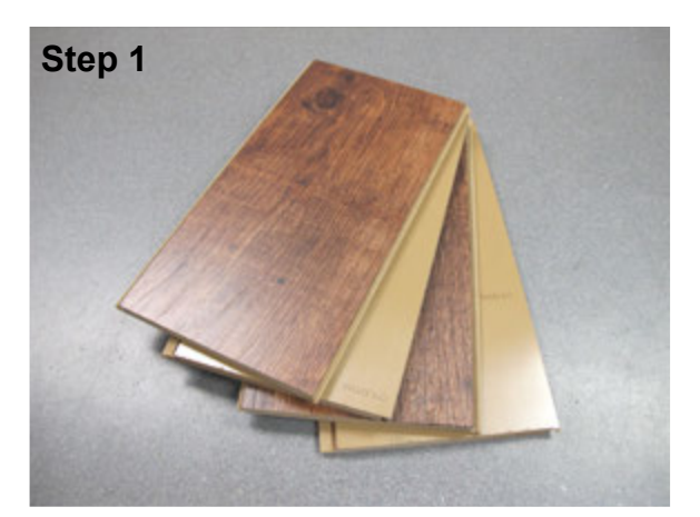
Cut 4 pieces 16-in (40-cm) long. Stack pieces back to back. Wrap stack in two layers aluminum foil.