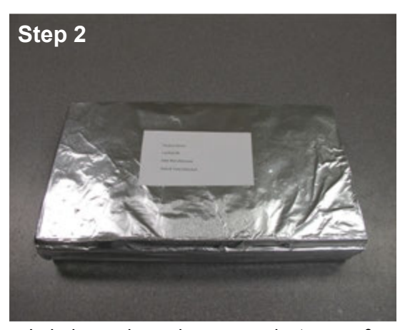
Label sample package – product name & number, date manufactured, lot/batch number, date & time collected